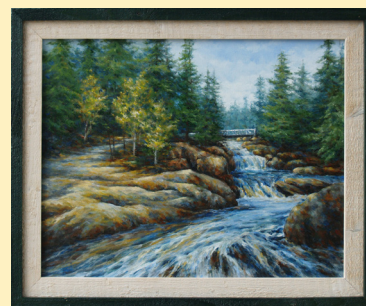
Vermont Stream, 16x20, SOLD

The painting at left is framed in Tom's signature framing style. Tom builds these frames using cedar harvested from our woodland.