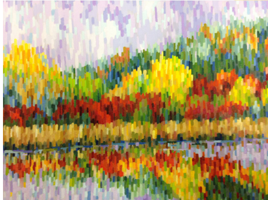
Westport Pond, Rainy Morning, 11x14_ $300

Once there, he gained experience in sculpture, painting, drawing and even working with fine metals.