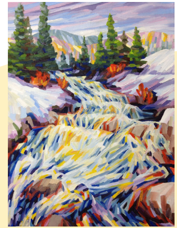
Beaupre Stream, 12x16, $300

From pencil work through oils and sculpture, Tom's work is rendered with care and sensitivity. Even his 2-dimensional work has a tactile sensibility.